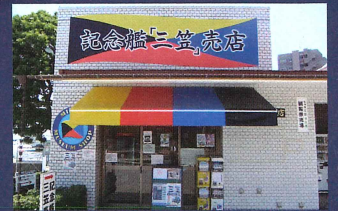
MIKASA Souvenir Shop